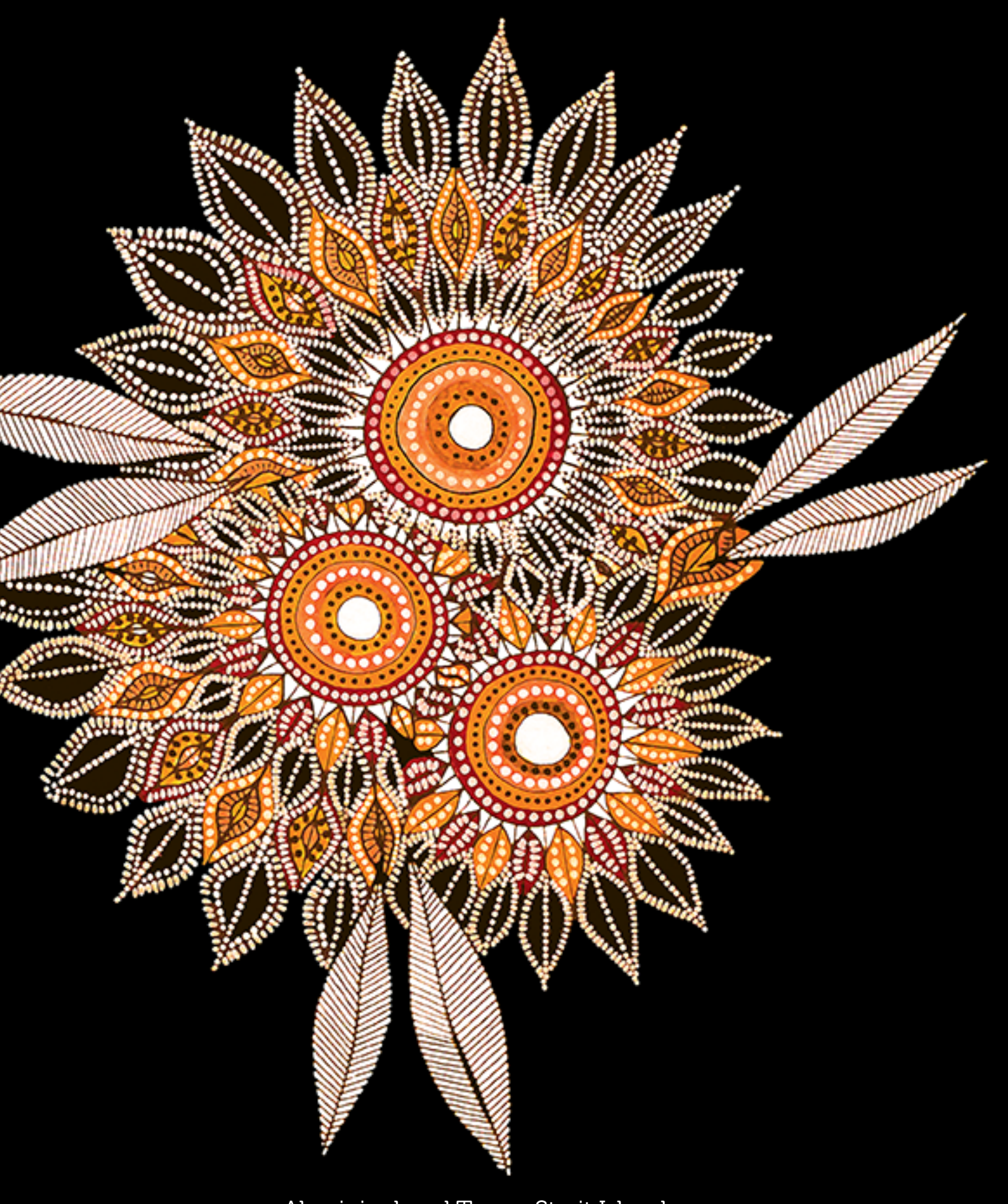
Aboriginal and Torres Strait Islander Employment Plan 2016–2020